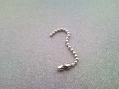
Part 14 & 15